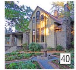
Inman Park Festival & Parade